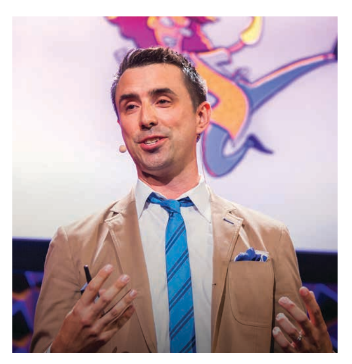
5 Why lunch ladies are heroes JARRETT J. KROSOCZKA