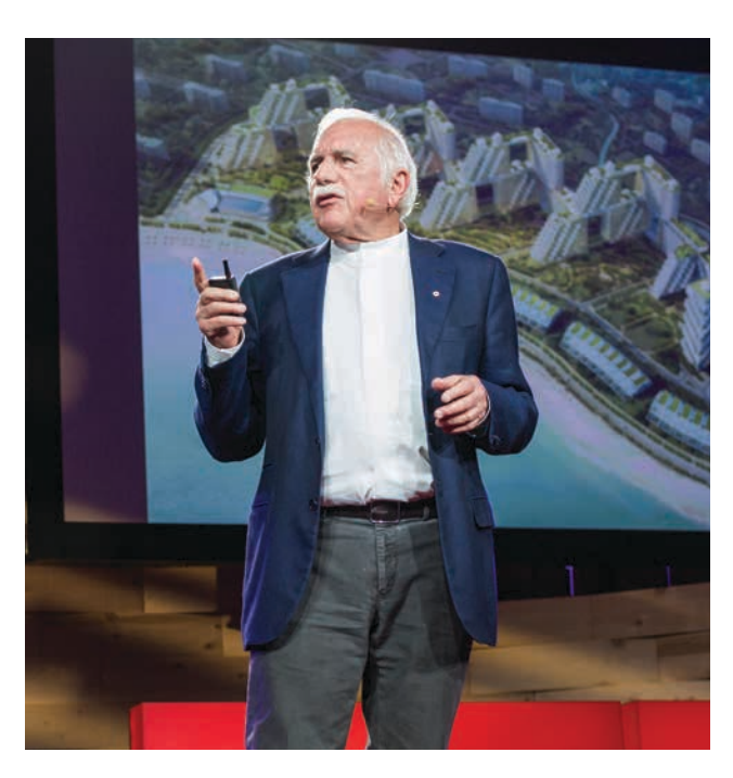
7 How to reinvent the apartment building MOSHE SAFDIE