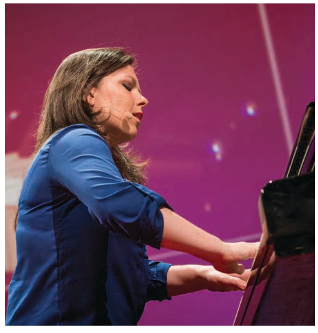
4 Why I take the piano on the road ... and in the air